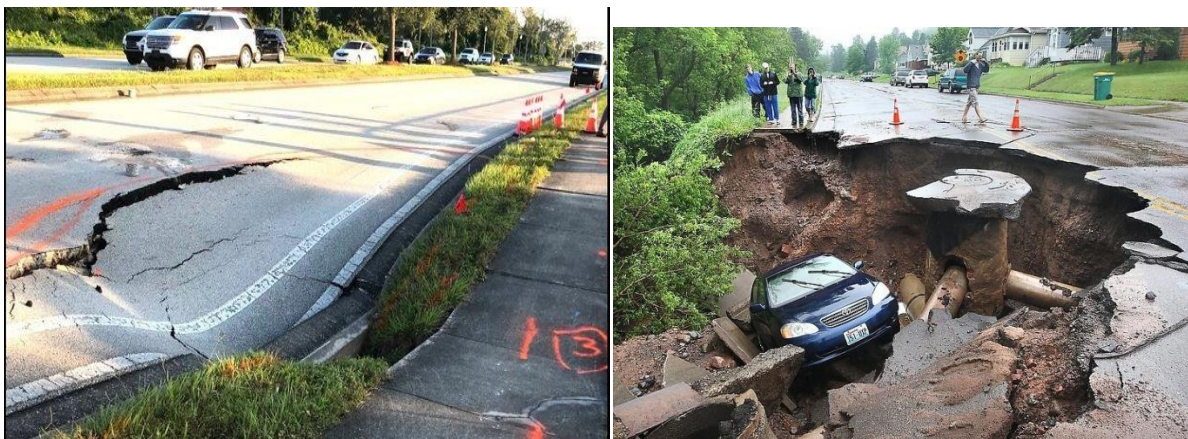
Fig 2. Land subsidence and Sink hole in Florida (WFTV Report, 2018)

The basic cause of land subsidence is a loss of support below ground. In other words, sometimes when water is taken out of the soil, the soil collapses, compacts, and drops. This depends on a number of factors, such as the type of soil and rock below the surface. Land subsidence is most often caused by human activities, mainly from the removal of subsurface water. The formation of sinkholes involves natural processes of erosion or gradual removal of slightly soluble bedrock (such as limestone) by percolating water, the collapse of a cave roof, or a lowering of the water table brought about by over pumping of groundwater.